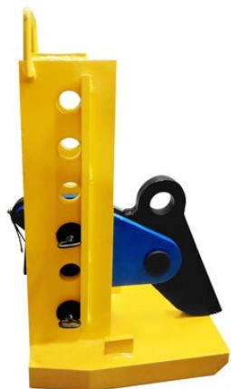
Plate clamp for horizontal lifting of bound steel sheet bundles or individual thick steel plates. Used in pairs.