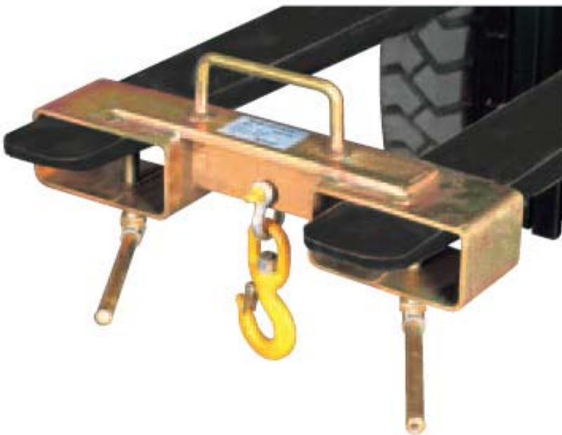
product code: TRUNP2 1000 kg