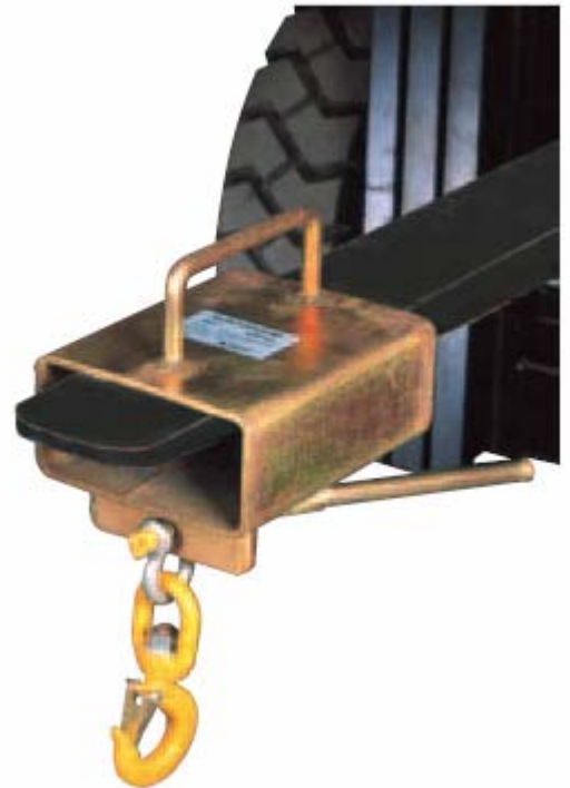
product code: TRUNP1 1000 kg